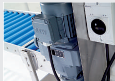
Infinitely variable speed