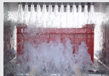
Cleansing through nozzles from above and from below .

Please contact us. We can design the work flow for you.